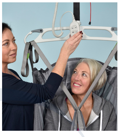
Stay Active and Independent inside your Home and On The Go.