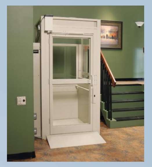
Their smaller footprint makes them a practical alternative to a ramp and more affordable than an elevator!