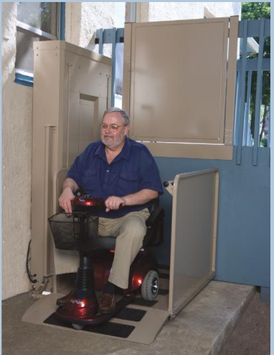
Strong and Durable... Convenient Access to Your Porch or Deck, or Floor to Floor Inside Your Home!