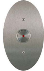
Figure 3: Hall Call

Hall Call buttons are installed at all landings to move the cab to the landing from which it is being called. An optional key switch limits the use of the elevator to authorized persons only.