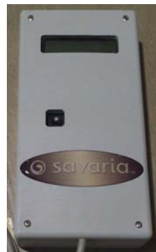
Figure 4: Reset Button Pendant

In the event that the elevator is not functioning properly, try resetting the elevator by pressing the star (asterisk) key on the Reset Button Pendant. If the problem persists, contact your Authorized Dealer for assistance.